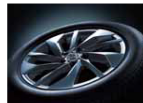
18-inch alloy wheel